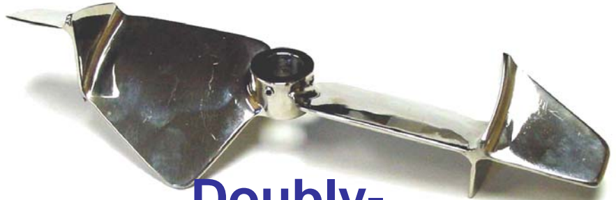
Doubly- Pitched HiFlow